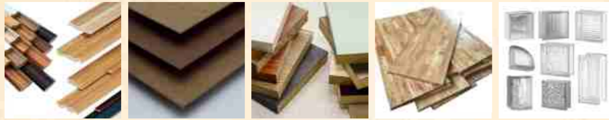
Wooden Beadings Hard Boards Particle Boards Rubber Wood Sheet Glass Blocks