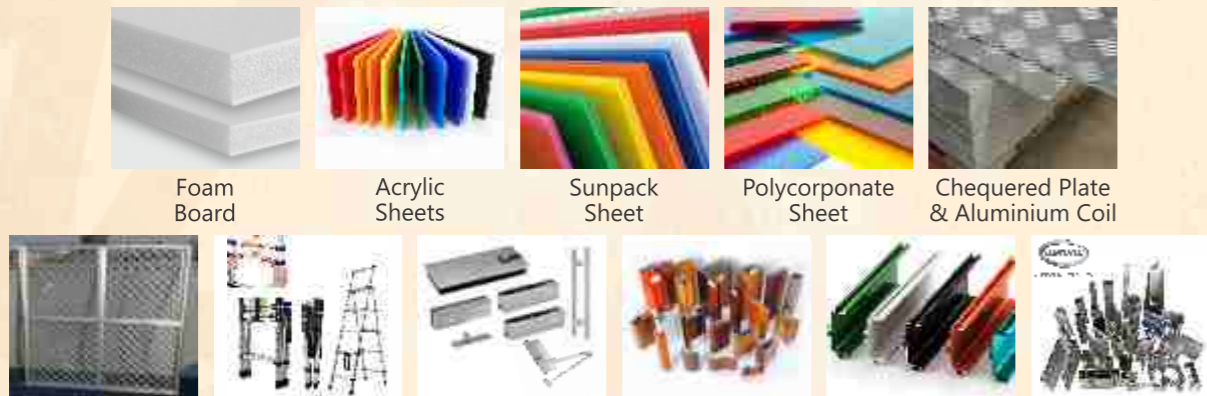
Foam Board Acrylic Sheets Sunpack Sheet Polycarbonate Sheet Chequered Plate & Aluminium Coil Aluminium Grill Aluminium Ladder Floor Springs & Door Closer Powder Coated & Colour Anodized Aluminium Section